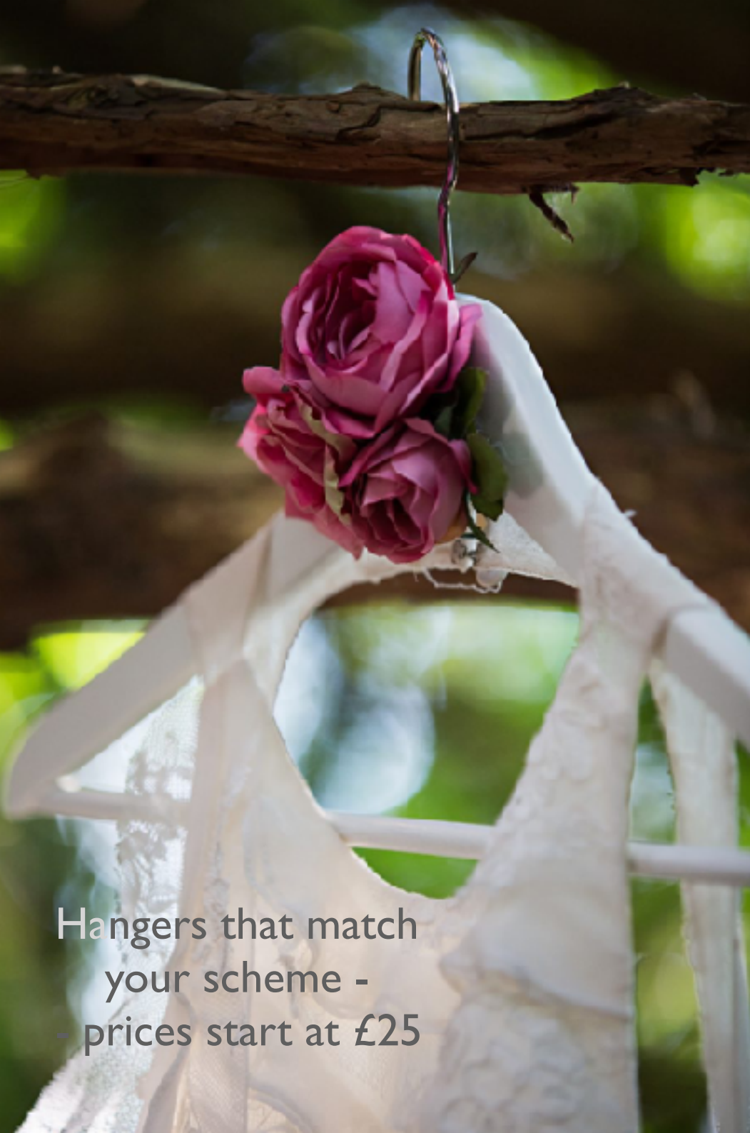
Hangers that match your scheme - - prices start at £25